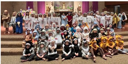
KINDERGARTEN CHRISTMAS PAGEANT