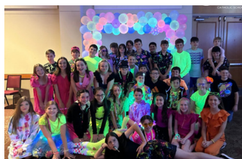
SIXTH GRADE DANCE