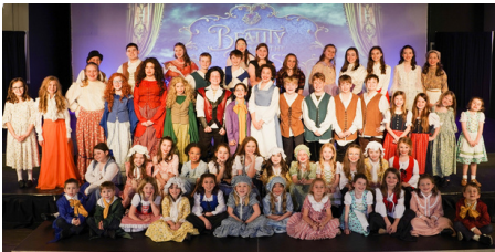
BEAUTY AND THE BEAST, JR

OLPS is the place to be. Here are a few of the many highlights from the school year.