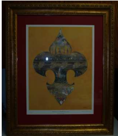
Donated by City of Natchitoches & Fads and Frames