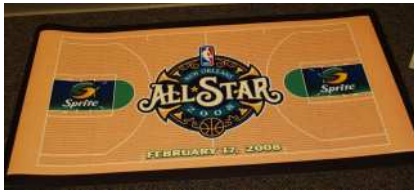
Donated by Coca Cola