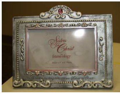
Donated by Immaculate Heart of Mary