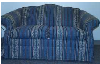
Donated by Carroll Furniture