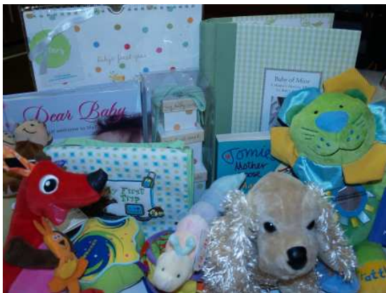
Donated by Books A Million