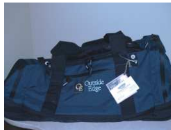
Donated by Security Sporting Goods