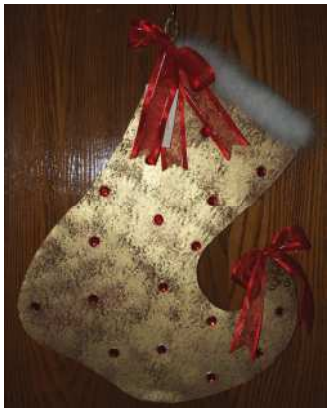
Donated by Southern Chic