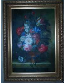
Donated by Five Star Furniture