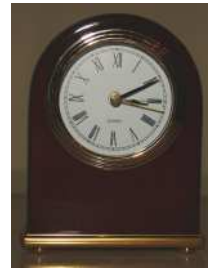
Donated by LA Trophies