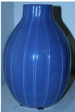
Donated by Ashley Furniture