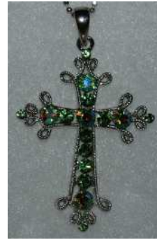
Donated by Sassy Girl